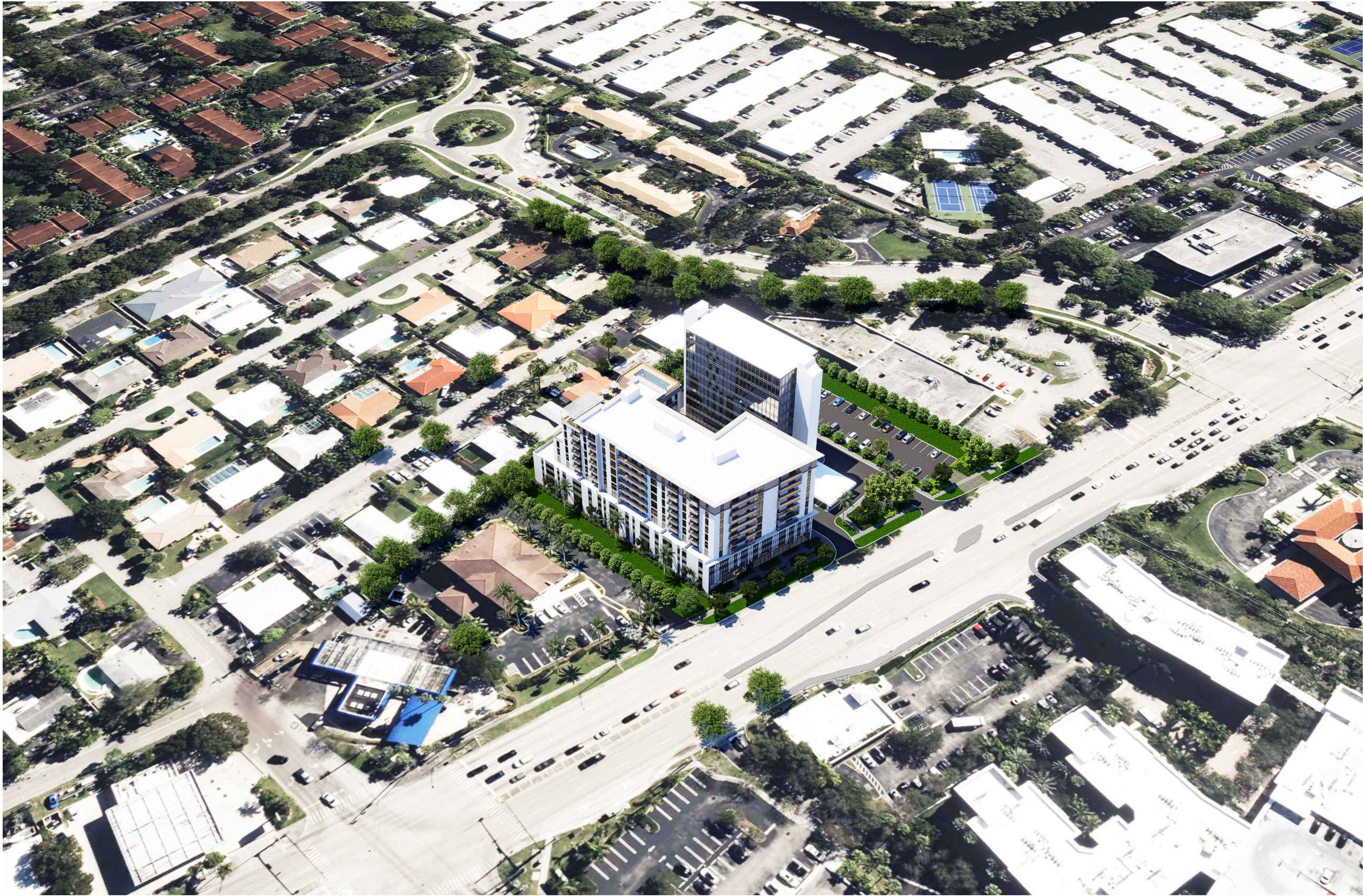
AREA VIEW LOOKING SOUTH EAST